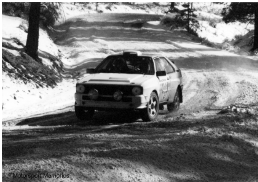
Piers O'Hanlon - 2003 Open 4WD Champion