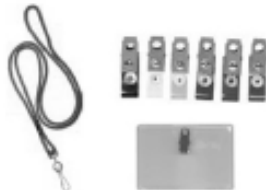
All ID badging accessories