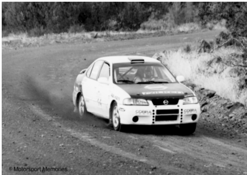
Dave Coleman & Amar Sehmi - 2003 Group 2 / 5 Champions