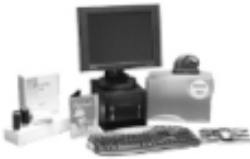
Complete Digital ID card systems starting as low as $995.00