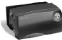
Fargo PVC card printers Authorized FARGO Solution Provider Authorized Service Provider