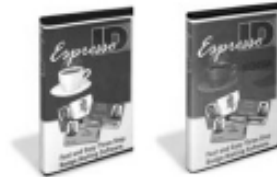
EspressoID Software Solutions